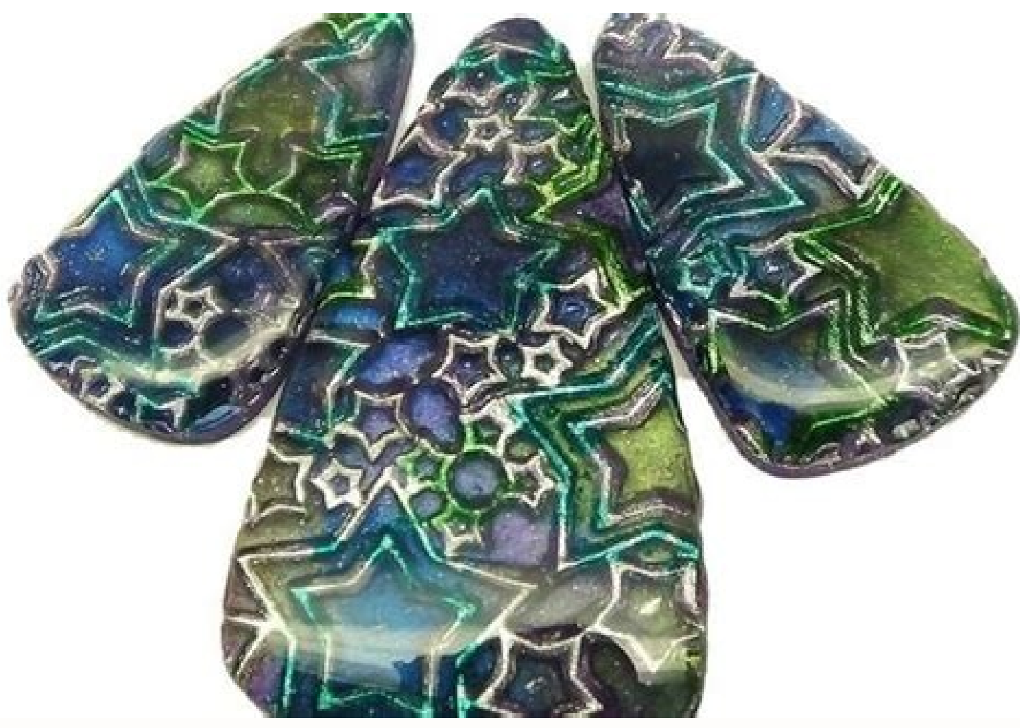
Brunei batik techniques. Modern batik techniques. Types of batik techniques. Batik techniques youtube. How to make batik techniques. How to use batik techniques. Tie dye and batik techniques. Different batik techniques.